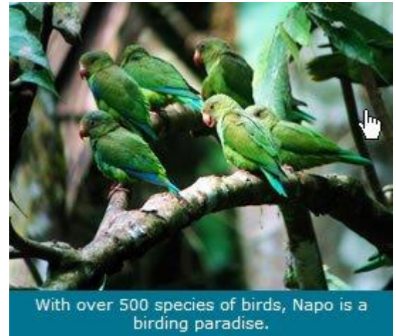
With over 500 species of birds, Napo is a birding paradise.

Your naturalist guide accompanies you on a variety of adventures in this remote reserve, exploring the rivers, lagoons and forests surrounding the lodge. Napo Wildlife Center occupies an 82 square mile portion of Yasuni National Park. With 2 nearby parrot licks and a canopy tower, you have myriad opportunities to view some of the 550 species of birds, 11 primate species, and the stars of the reserve, giant river otters. Overnight Napo Wildlife Center. [BLD]