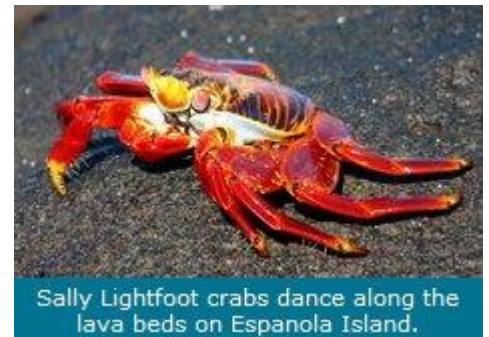
Sally Lightfoot crabs dance along the lava beds on Espanola Island.

Dry landing. Learn more about the lava terrain and cross the inactive lava fields. Besides the sea lion colonies, this is a very important site for bird watching. Many species, such as the hooded mocking bird and red-billed tropic bird can be seen and observed closely. You will also see a large colony of marine iguanas, lava lizards, and Sally Light-foot crabs. After a short trek, visitors will see colonies of masked and blue-footed boobies. The nesting grounds sometimes overlap the trail. Visitors will also find Galapagos doves, hawks and swallow-tailed gulls and then reach the world's largest colony of waved albatross. A major highlight is their mating season from May through December. You'll visit the famous blowhole, where water shoots about 23 m (75 ft) into the air.