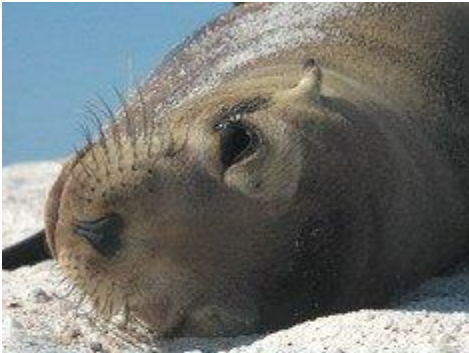
Walk and snorkel among playful sea lions - a highlight of your adventure in the islands.

All of the highly-qualified multilingual nature guides are certified by the Galapagos National Park. On visits to the islands, they will accompany you every step of the way, taking time to explain the highlights as you wander through this new and magical land. Every evening, these same guides will give you a lecture illustrated with multimedia presentation, imparting and sharing with you their knowledge of geology, history, evolution, flora and fauna of the islands. Enjoy the various activities on board. Have fun singing with our karaoke and dancing in the Neptune party. Children also have their special spot at the Kids Corner where they can have as much fun as possible. On board nights are magical, full of bright stars and countless constellations.