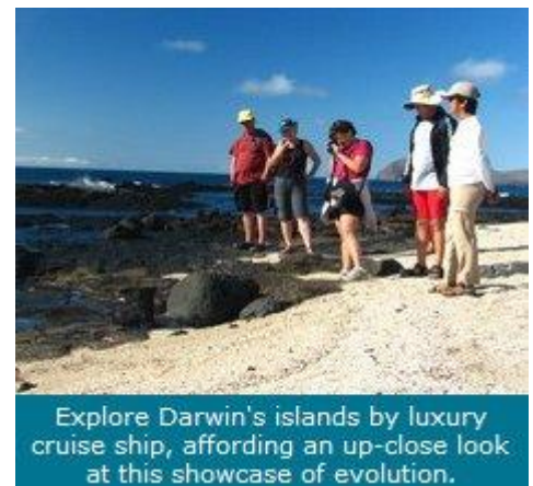
Explore Darwin's islands by luxury cruise ship, affording an up-close look at this showcase of evolution.

Guests will see swallow-tailed gulls and sea lions. This site is a major nesting colony of blue footed boobies, and has the largest colony of the magnificent frigate bird. Travelers will also see both marine iguanas and land iguanas and will have opportunities for snorkelling. Overnight on board in Superior Cabin. [BLD]