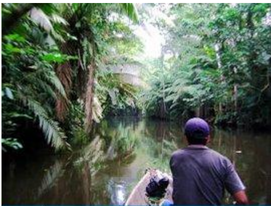
A two-hour canoe ride takes you to the Napo Wildlife Center in Ecuador's Amazon Basin.

Meals Included: B-Breakfast, L-Lunch, D-Dinner